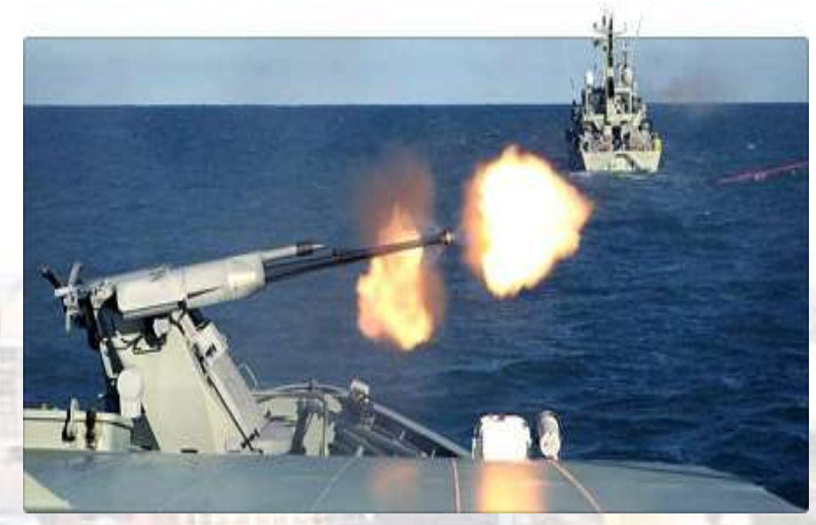
The Rafael .25 calibre Mini-Typhoon weapons system was also installed by our personal. A total of 7 RAN Ships either were "Fit For" or "Fit With" depending on the deployment. These projects were predominantly carried out at the Garden Island Ship Repair facility or the Forgacs Ship Maintenance Facility in Newcastle NSW.

EME personnel installed the Rafael .50 calibre Typhoon automatic Weapons system to 2 of the RAN Fleet of Kanimbla class LPAs.